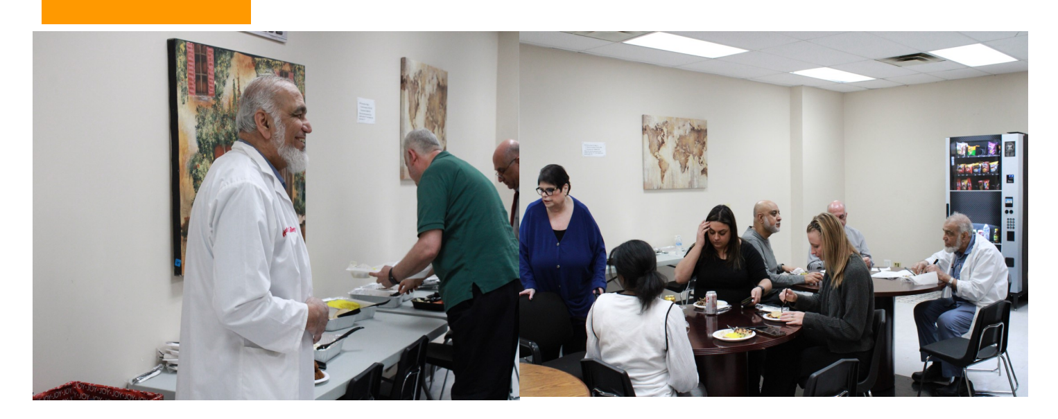
Faculty and staff gather to celebrate ABHES renewal announcement

ed that this achievement was truly a team effort. Faculty and staff devoted many hours after our 2024 pre-renewal ABHES site visit to insure compliance with ABHES recommendations. Much time was spent writing and proofing documents for thoroughness and accuracy. All noted as well, that this success moves the school forward in its efforts to expand enrollment and to offer additional in-demand programs for students seeking rewarding careers in the health sciences field.